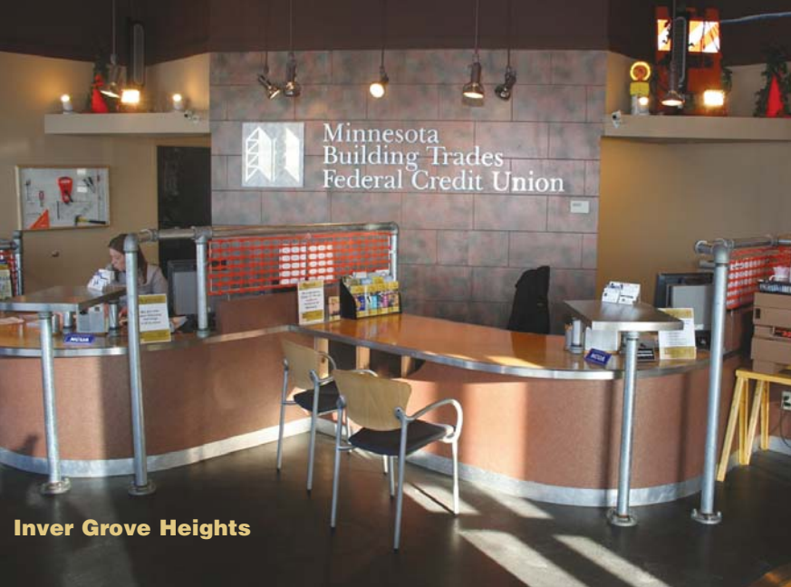
Inver Grove Heights