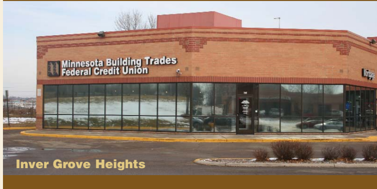
Inver Grove Heights